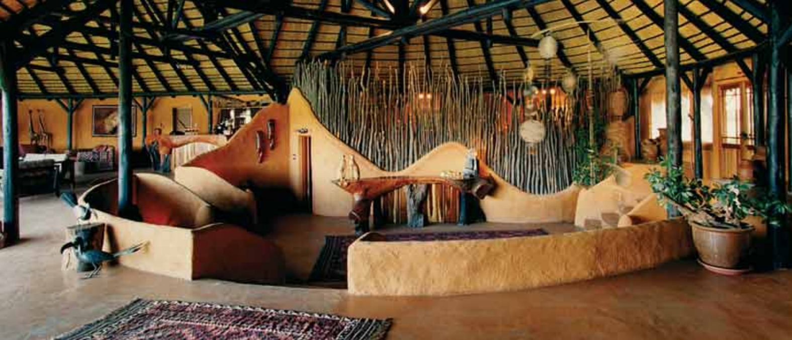
Honeymoon Suite Bush Camp Lapa