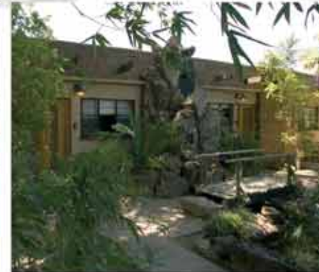
Garden View Room Garden View Rooms